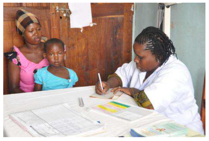
Health worker diagnoses child through algorithm in IMCI chart booklet

World Health Organization Novartis Foundation for Sustainable Development Swiss TPH