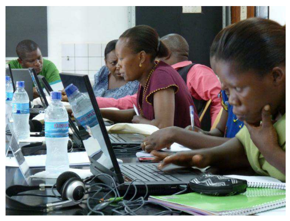
Field-testing IMPACtt, TTCIH, Ifakara, Tanzania, February 2012