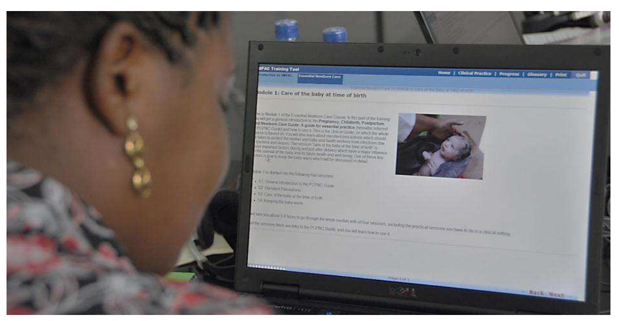
Field-testing IMPACtt, TTCIH, Ifakara, Tanzania, February 2012